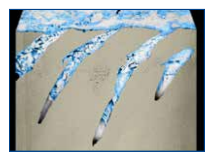
Novel data fusion image combining 3D imaging data overlaid with DSIMS stannous data (blue) from the same