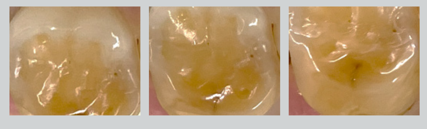
b. Intra-oral scanner