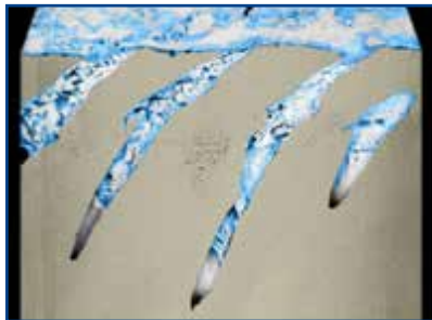
Novel data fusion image combining 3D imaging data overlaid with DSIMS stannous data (blue) from the same